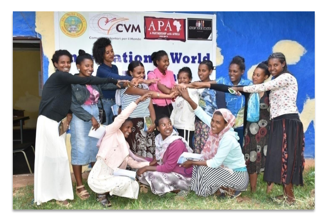
Image 4: Research participants - returnee migrant domestic workers in Amhara region

As noted above a total of 67 participants, including 54 migrant domestic workers, were interviewed in individual interviews, focus group discussions and key informant interviews. Discussions in these interviews and FGDs in many ways reflected the findings of similar studies which have found the experiences of migrant domestic workers from Ethiopia to the ME to be largely negative. This section outlines in detail the experiences of migrant domestic workers during the migration process, in the countries of destination, and following their return to Ethiopia as told by migrant domestic workers themselves as well as by their families and representatives.