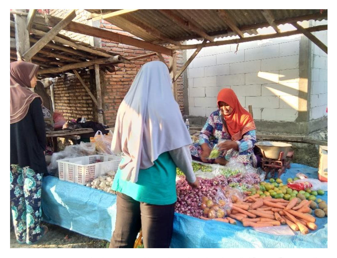
Figure 1: An FPAR researcher buying vegetables at the traditional market called "Tanjung" in Curut village