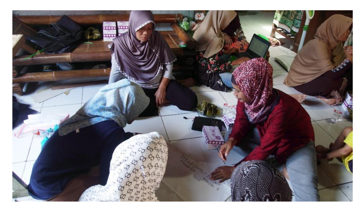
Figure 2: FGD on safe and fair migration from the perspective of women migrant workers in Curut