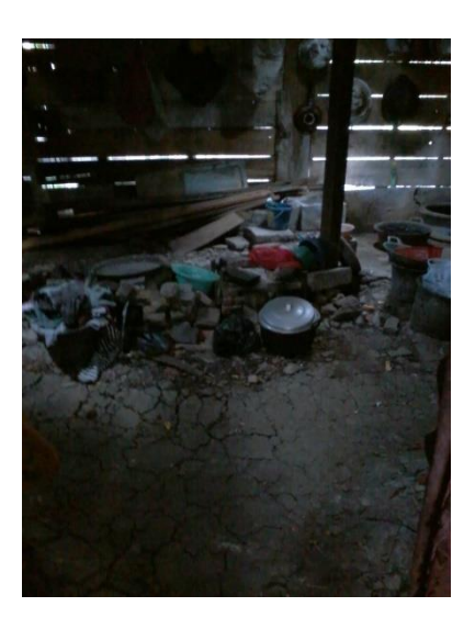
Yuli Prehati's Kitchen