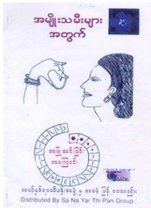
Cover of Booklet on Fertility Awareness

The GAATW Latin American and Caribbean Consultation is now in progress at the Dominican Republic. Many of our Latin American members are participating in this. Look out for a more detailed update on this in the next issue of the E-bulletin.